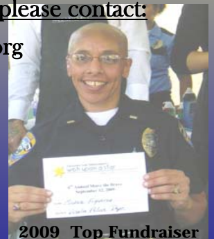
2009 Top Fundraiser